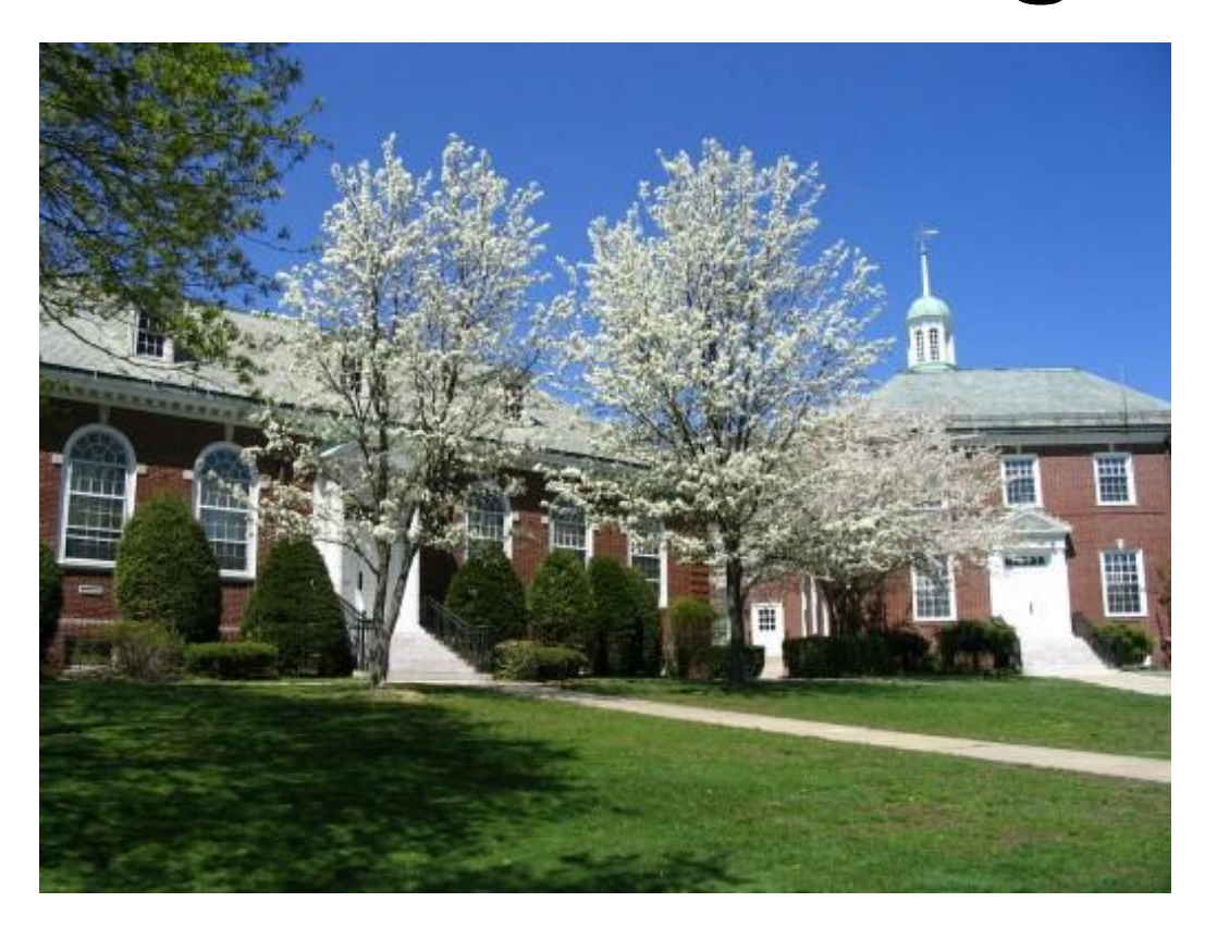
Select Board Water & Sewer Rate Discussion May 23, 2023